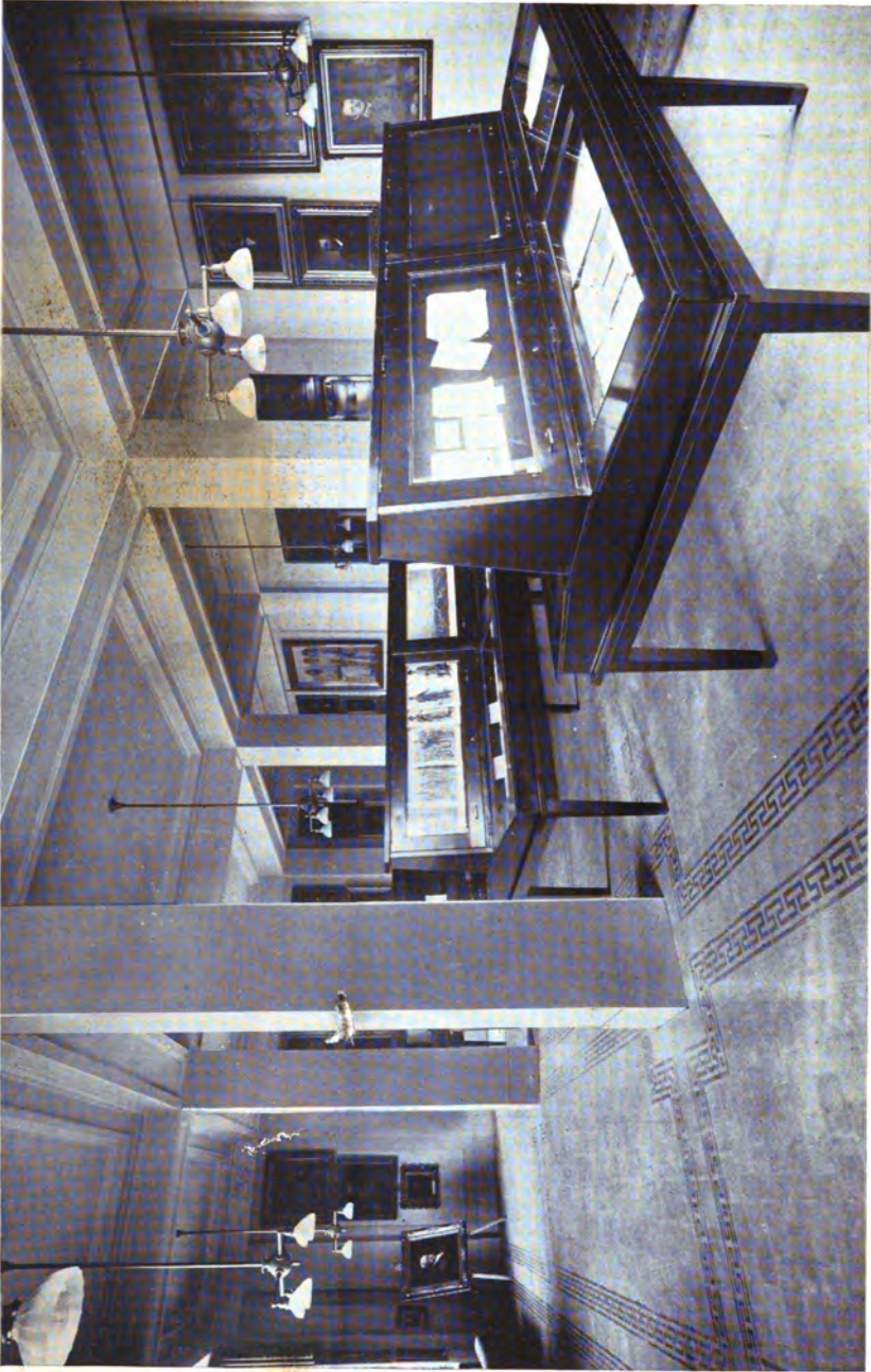
NORTH CAROLINA HALL OF HISTORY. East Hall.