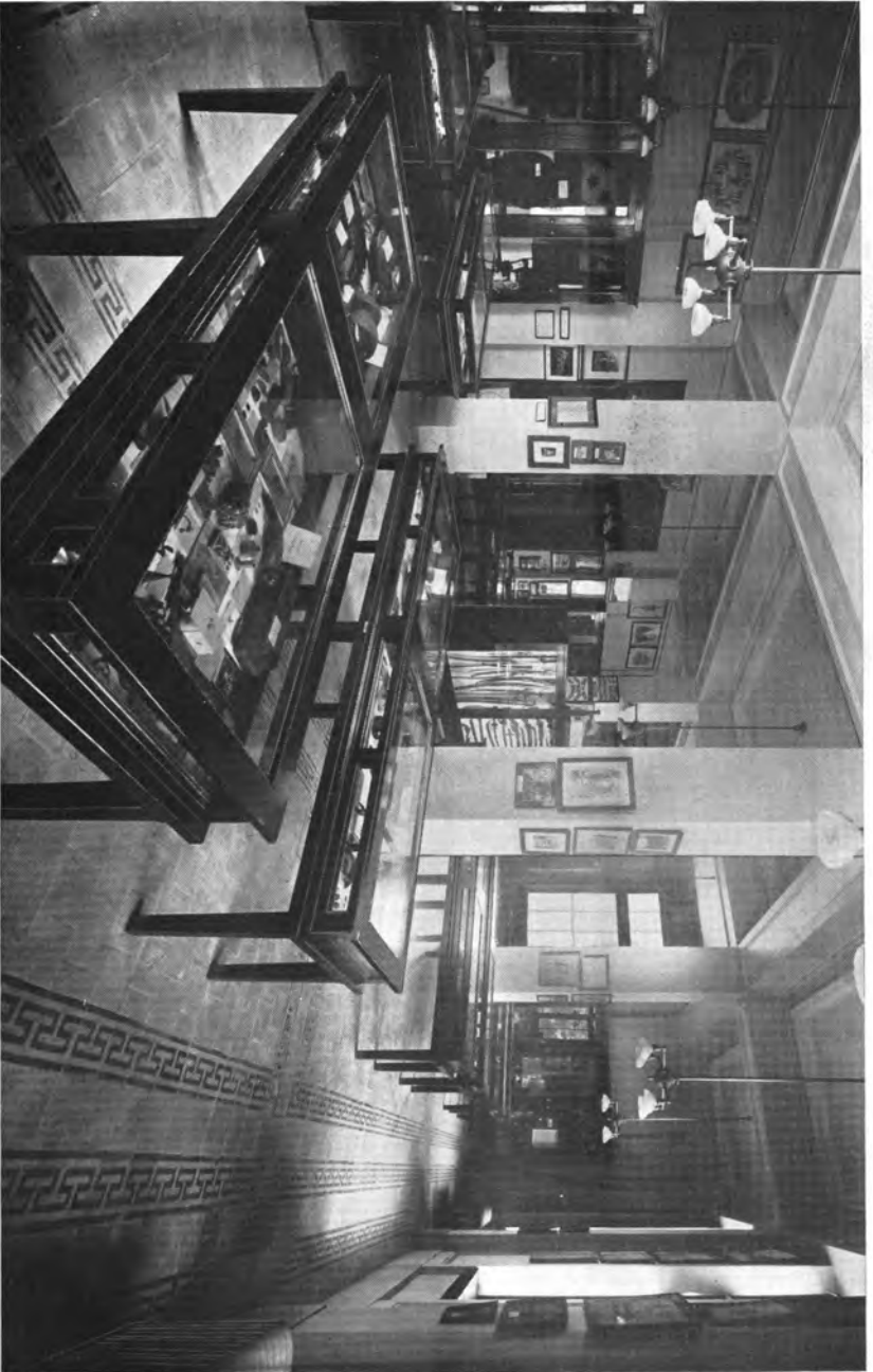
NORTH CAROLINA HALL OF HISTORY, West Hall.